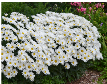
AMAZING DAISIES® 'Daisy May' Leucanthemum superbum Free flowering, heavy repeat blooms. Fast growing perennial. ⬇️ 12-24" • ⬅️ 10-14" • Zones: 5-9