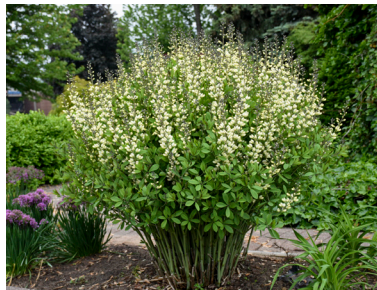
DECADENCE® 'Vanilla Cream' Baptisia Cream flowers in early summer. Heat and drought tolerant. Handles heavy soils. ⬆️ 2½-3' • ⬅️ 3-3½' • Zones: 4-9