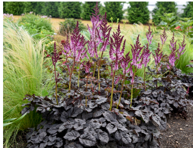
'Dark Side of the Moon' Astilbe Near black foliage and purple flowers. Season long foliage interest. Grows sun to shade. ⬆️ 20-22" • ⬅️ 24-28" • Zones: 4-9