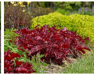
DOLCE® 'Cherry Truffles' Heuchera Fastastic cherry red foliage holds its color well through the seasons. Grows sun to shade. ⬆️ 8-10" • ⬅️ 26-30" • Zones: 4-9