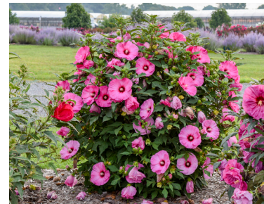
SUMMERIFIC® 'Candy Crush' Hibiscus Dense, rounded habit. Massive 8" flowers appear the length of the stem. ⬆️ 4-4½' • ⬅️ 4-4½' • Zones: 4-9