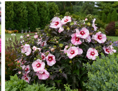
SUMMERIFIC® 'Cherry Choco Latte' Hibiscus Dense, rounded habit. Massive 8-9" flowers appear the length of the stem. ⬆️ 4' • ⬅️ 4' • Zones: 4-9