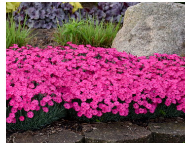
'Paint the Town Magenta' Dianthus Much longer lived in the landscape. Earlier and far more floriferous than traditional cultivars. ⬆️ 6-8" • ⬅️ 16-18" • Zones: 4-9