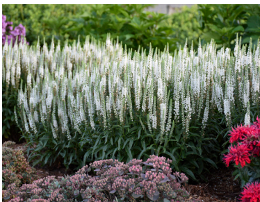
MAGIC SHOW® 'White Wands' Veronica Low, wide, well-branched. Does not need to be trimmed for continuous bloom. ⬆️ 14-16" • ⬅️ 16-20" • Zones: 4-8