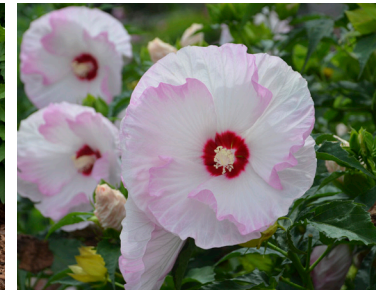
SUMMERIFIC® 'Ballet Slippers' Hibiscus Dense, rounded habit. 7" ruffled flowers appear the length of the stem. ⬆️ 4' • ⬅️ 4½-5' • Zones: 4-9