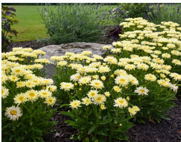
AMAZING DAISIES® 'Banana Cream II' Leucanthemum superbum Free flowering, heavy repeat blooms. Fast growing perennial. ⬇️ 20-24" • ⬅️ 20-22" • Zones: 5-9