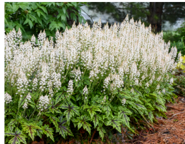
'Cutting Edge' Tiarella Native woodland perennial. Covered in flowers in spring, doubling its height. Semi-evergreen foliage. ⬆️ 8-10" • ⬅️ 16-18" • Zones: 4-9