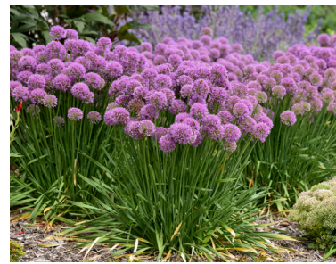
'Serendipity' Allium A long blooming, drought and deer resistant perennial. Globe-like purple flowers. Attractive seedheads follow. ⬆️ 15-20" • ⬅️ 15-20" • Zones: 4-8