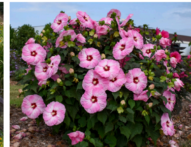
SUMMERIFIC® 'Spiderella' Hibiscus Dense, rounded habit. Massive 8" flowers appear the length of the stem. ⬆️ 4-4½' • ⬅️ 4½-5' • Zones: 4-9