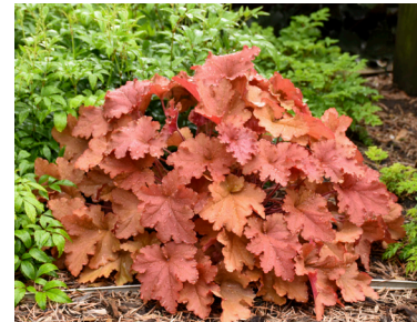
PRIMO® 'Peachberry Ice' Heuchera Fastastic apricot orange foliage holds its color well through the seasons. Grows sun to shade. ⬆️ 8-10" • ⬅️ 30-34" • Zones: 4-9