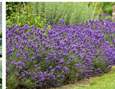
Sweet Romance® Lavandula angustifolia Long-blooming, fragrant. Incredibly floriferous selection. Deer and rabbit resistant. Heat and drought tolerant. ⬆️ 12-18" • ⬅️ 12-18" • Zones: 5-9