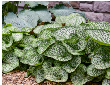
'Jack of Diamonds' Brunnera macrophylla Deer resistant. Tolerates dry shade. Massive leaves reach more than 12" wide. Excellent disease resistance. ⬆️ 14-16" • ⬅️ 28-32" • Zones: 3-8