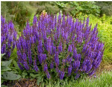
'Violet Profusion' Salvia nemorosa Prolific rebloomer, blooming up to four cycles in one season when trimmed. Deer and rabbit resistant. ⬆️ 14-16" • ⬅️ 16-20" • Zones: 3-8