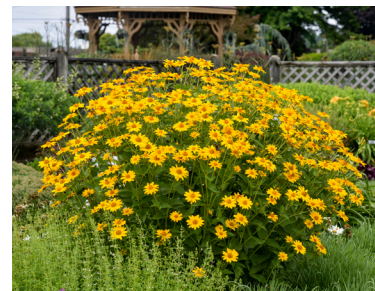
'Tuscan Sun' Heliopsis helianthoides Compact and sturdy, excellent disease resistance, free flowering. Heat and drought tolerant. ⬆️ 24-36" • ⬅️ 20-24" • Zones: 3-9