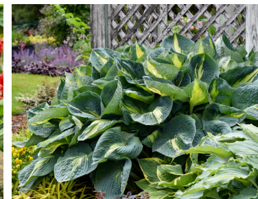
SHADOWLAND® 'Hudson Bay' Hosta Giant hosta with thick, variegated leaves. Good sun tolerance, handles heavy soils. ⬆️ 3-3½' • ⬅️ 5-6' • Zones: 3-9