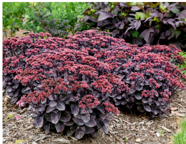
ROCK 'N GROW® 'Back in Black' Sedum Black foliage looks nice all season. Red flowers in fall. Heat and drought tolerant. ⬆️ 20-24" • ⬅️ 26-30" • Zones: 3-9