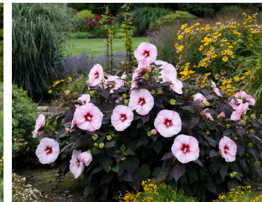
SUMMERIFIC® 'Perfect Storm' Hibiscus Dense, rounded habit. Massive 7-8" flowers appear the length of the stem. ⬆️ 3' • ⬅️ 4½-5' • Zones: 4-9