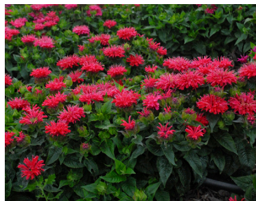
'Pardon My Cerise' Monarda didyma Cerise red flowers on a compact, well-branched habit. Excellent mildew resistance. Deer resistant. ⬆️ 14-18" • ⬅️ 10-12" • Zones: 4-8