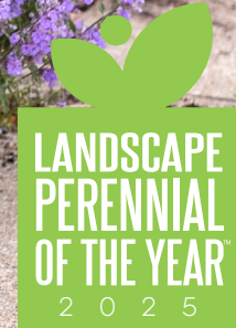
'Cat's Meow' Nepeta faassenii