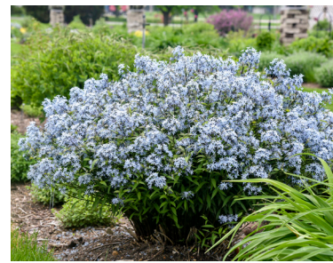
'Storm Cloud' Amsonia tabernaemontana Excellent longevity, heat and drought tolerance. One of the earliest perennials to emerge in spring. ⬆️ 24-30" • ⬅️ 38-42" • Zones: 4-9