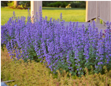
'Cat's Meow' Nepeta faassenii Tidy, dense habit that keeps its shape all season long. Deer and rabbit resistant. Heat and drought tolerant. ⬆️ 17-20" • ⬅️ 24-36" • Zones: 3-8