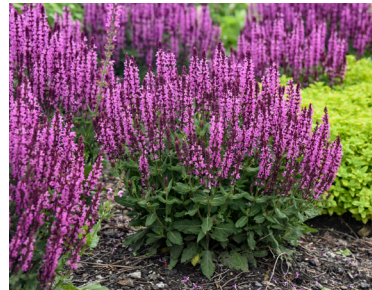
'Pink Profusion' Salvia nemorosa Prolific rebloomer, blooming up to four cycles in one season when trimmed. Deer and rabbit resistant. ⬆️ 14-16" • ⬅️ 16-20" • Zones: 3-8