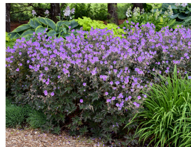
'Boom Chocolatta' Geranium Dark bronze foliage with purple flowers. Blooms all summer. Grows sun to shade. Deer and rabbit resistant. ⬆️ 24-26" • ⬅️ 28-30" • Zones: 4-8