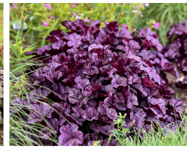
DOLCE® 'Wildberry' Heuchera Fastastic plum purple foliage holds its color well through the seasons. Grows sun to shade. ⬆️ 10-14" • ⬅️ 16-20" • Zones: 4-9