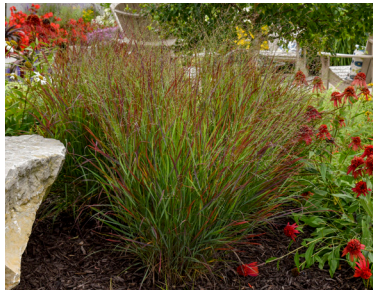
PRAIRIE WINDS® 'Cheyenne Sky' Panicum virgatum Vase-shaped habit of red foliage. Deer resistant, heat and drought tolerant. ⬆️ 3' • ⬅️ 1½' • Zones: 4-9