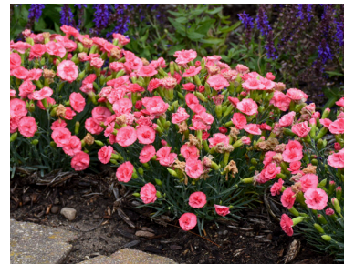
FRUIT PUNCH® 'Classic Coral' Dianthus Long blooming, fragrant perennial. Good heat and humidity tolerance. ⬆️ 2½-3' • ⬅️ 3-3½' • Zones: 4-9