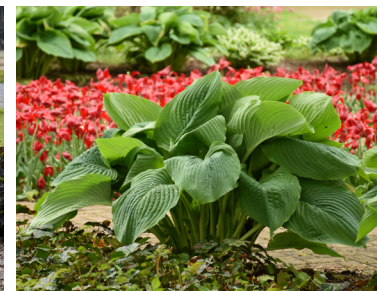
SHADOWLAND® 'Empress Wu' Hosta Giant hosta with thick, green leaves. Good sun tolerance. Handles heavy soils. ⬆️ 3-4' • ⬅️ 5-6' • Zones: 3-9