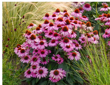
COLOR CODED® 'The Fuchsia is Bright' Echinacea Wide, purple colored flowers on tall habits. Heat and drought tolerant. ⬆️ 20-22" • ⬅️ 16-18" • Zones: 4-8