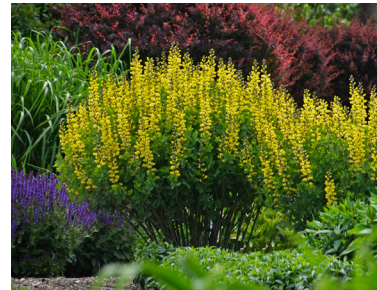
DECADENCE® 'Lemon Meringue' Baptisia Yellow flowers in early summer. Heat and drought tolerant. Handles heavy soils. ⬆️ 3' • ⬅️ 3' • Zones: 4-9