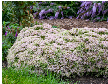
ROCK 'N ROUND® 'Pure Joy' Sedum Rigid, domed Sedum. Serrated blue-green leaves. Heat and drought tolerant. ⬆️ 10-12" • ⬅️ 16-20" • Zones: 3-9