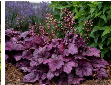
PRIMO® 'Wild Rose' Heuchera Fastastic bright rosy purple foliage holds its color well through the seasons. Grows sun to shade. ⬆️ 8-10" • ⬅️ 18-22" • Zones: 4-9