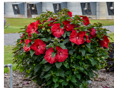
SUMMERIFIC® 'Valentine's Crush' Hibiscus Dense, rounded habit. Massive 7-8" flowers appear the length of the stem. ⬆️ 5' • ⬅️ 3½' • Zones: 4-9