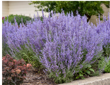
'Denim 'n Lace' Perovskia atriplicifolia Strong stems, stays compact, tidy upright habit. Doesn't run about or sprawl in the landscape like the species. ⬆️ 28-32" • ⬅️ 34-38" • Zones: 4-9