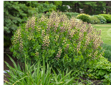
DECADENCE® DELUXE 'Pink Lemonade' Baptisia Pink and yellow flowers in early summer. Drought tolerant. Handles heavy soils. ⬆️ 3½-4' • ⬅️ 4' • Zones: 4-9