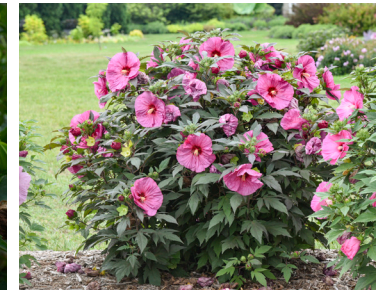
SUMMERIFIC® 'Berry Awesome' Hibiscus Dense, rounded habit. Massive 7-8" flowers appear the length of the stem. ⬆️ 4' • ⬅️ 4-4½' • Zones: 4-9