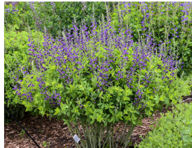
DECADENCE® 'Blueberry Sundae' Baptisia Blue flowers in early summer. Heat and drought tolerant. Handles heavy soils. ⬆️ 3' • ⬅️ 2½-3' • Zones: 4-9