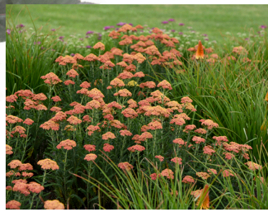
'Firefly Peach Sky' Achillea Light peachy orange flowers age to yellow. Deer and rabbit resistant. Blooms all summer. Heat and drought tolerant. ⬇️ 32-36" • ⬅️ 28-32" • Zones: 3-8