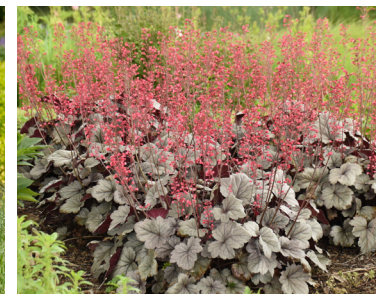
DOLCE® 'Silver Gumdrop' Heuchera Fastastic silver foliage holds its color well through the seasons. Grows sun to shade. Tall pink flower scapes. ⬆️ 6-8" • ⬅️ 14-16" • Zones: 4-9