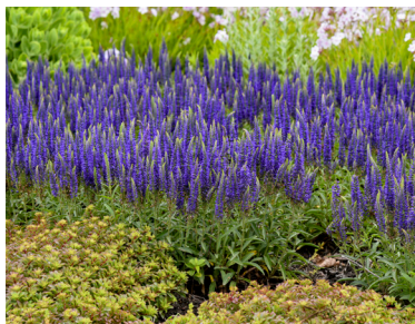
MAGIC SHOW® 'Wizard of Ahhs' Veronica Early, long blooming selection. Excellent branching prolongs bloom. ⬆️ 14-16" • ⬅️ 18-22" • Zones: 4-8