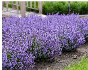
'Cat's Pajamas' Nepeta Compact, early blooming selection. Long blooming, deer and rabbit resistant perennial. Heat and drought tolerant. ⬆️ 12-14" • ⬅️ 18-20" • Zones: 3-8